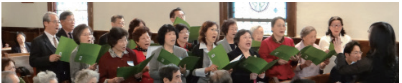
大紐約區台灣基督徒長輩會獻詩:我心大歡喜，我的嘴當吟詩 Senior Citizen Assn. of Taiwan Christians in Greater New York : O Thou, In Whose Presenc My Soul Takes Delight