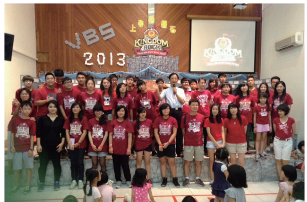
2013 6/30-7/13亞特蘭大台灣長老教會暑期短宣隊 2013 6/30-7/13 Atlanta TPC short-term mission team