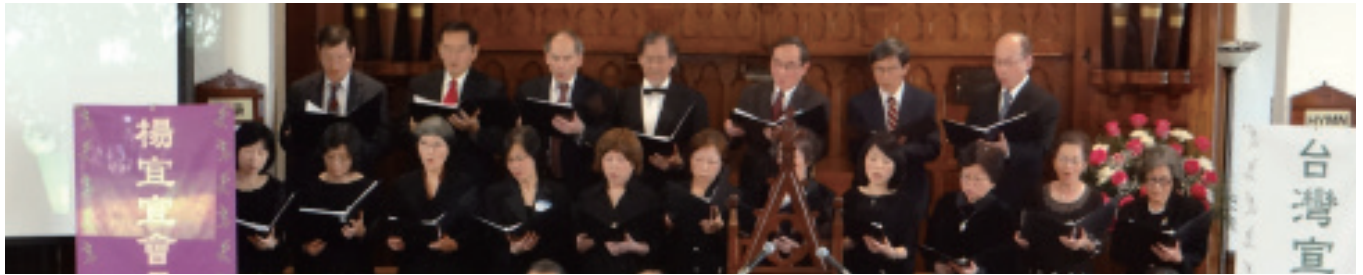
長島台灣教會聖歌隊頌詩:榮耀頌 Long Island Taiwanese Church Choir Praised : Gloria

Many groups blessed 4 ceremonies with beautiful songs