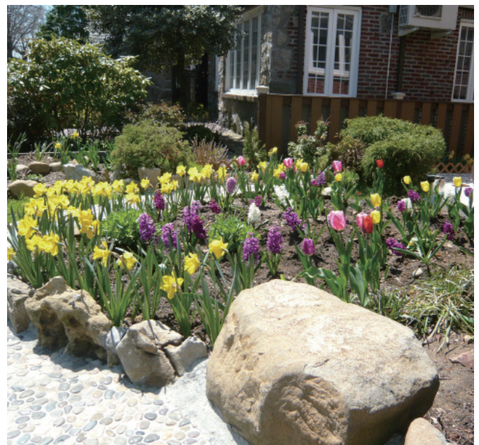
祈禱花園一角 One corner of TMF Prayer Garden.

【對祈禱花園的回應】 謝謝聖誕祝賀..看見神在你們身上的奇妙作為..為你們感謝主..... 知道你們要為社區提供”祈禱花園”..真的好棒喔....希望我們也有這樣的恩典來服務社區..同樣祝福你們:聖誕歡欣.新年蒙恩.