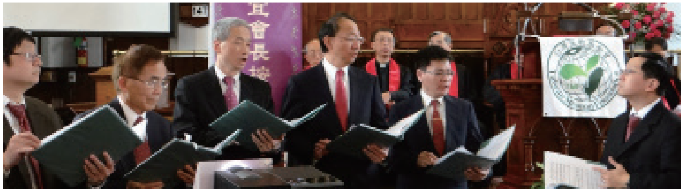
(Virginia維吉尼亞州)台灣基督協會合唱團祝詩:十字架真神組曲 Taiwanese for Christ Chorus Special Music:The True God on the Cross