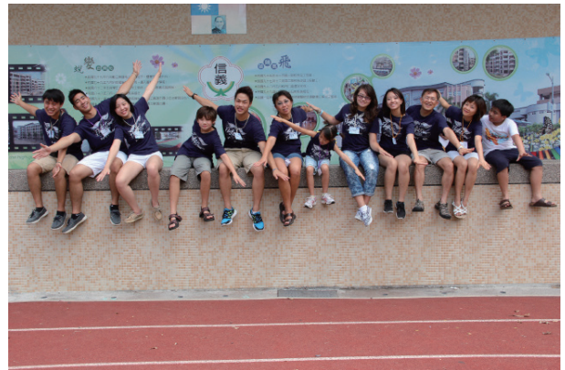
2012亞特蘭大台灣長老教會暑期短宣隊 2012 Atlanta TPC short-term mission team