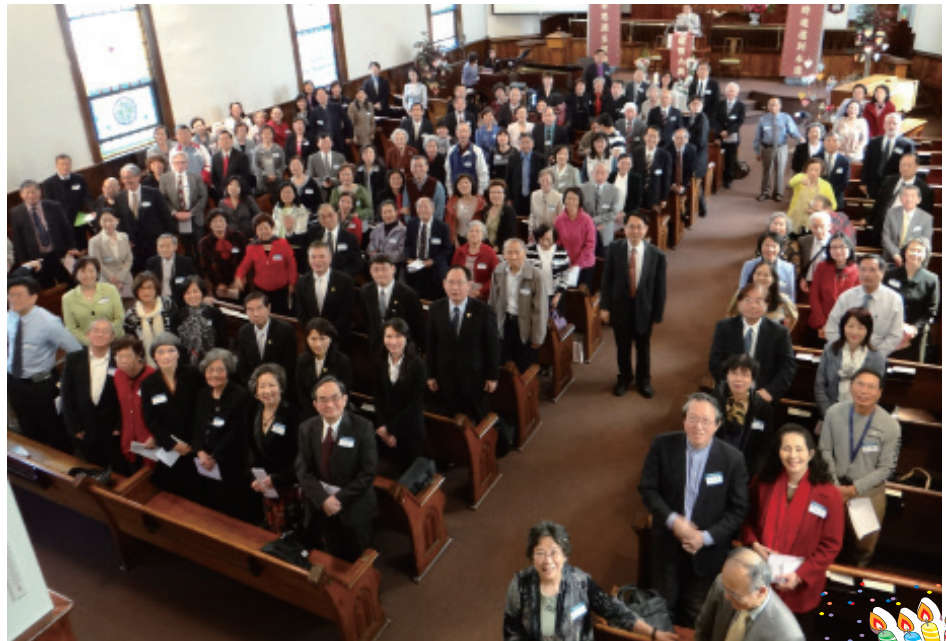
四大慶典：賓客帶來滿滿的祝福 The honorable guests brought blessings to TMF four ceremonies