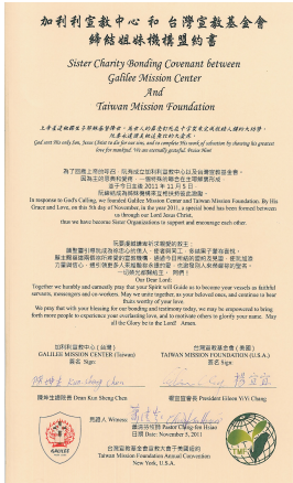
簽署之盟約 The Signed Covenant